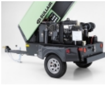
Clam Shell Canopy Compact/Lightweight Design.