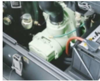
Rotary Screw Design by Sullair. The pioneer in rotary screw technology.