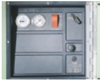
Curbside Instrument Panel With (SSAM) Shutdown System & Annunciation Module