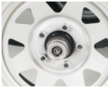
E-Z Lube Axle Offers convenient wheel bearing lubrication thru zerk fittings.