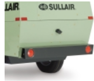
Rear Bumper Features recessed tail lights and license plate light.